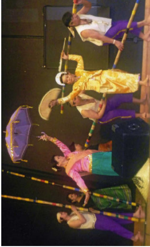
HIYAS Dance Troupe

“Hiyas” is a Filipino word meaning “Jewel” or “Gem”. The dance troupe is living up to its name by presenting Philippine culture through dances such as rituals of ethnic tribes, Muslim ceremonial dances, festive dances of the lowlanders, Spanish-inspired social dances, etc. The group also ventures to foreign cultural dances like the Hawaiian, Tahitian, Bollywood and Charleston to name a few.